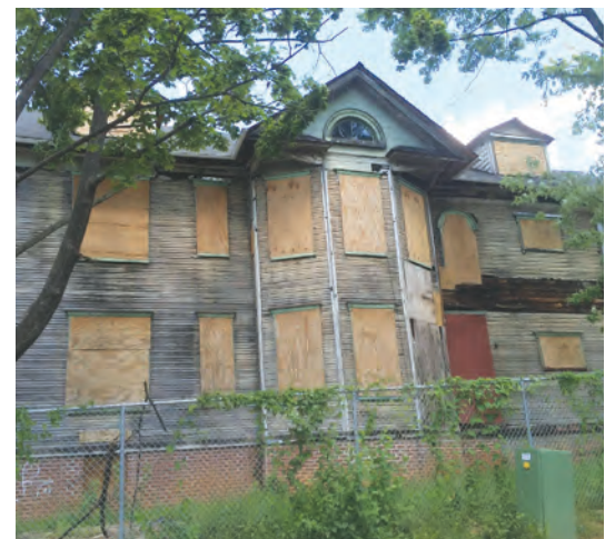
A blighted District house at 1220 Maple View Place SE on the proposed legislation.