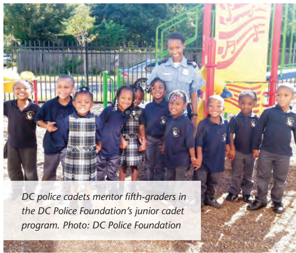
DC police cadets mentor fifth-graders in the DC Police Foundation's junior cadet program.

His grandfather served as a DC police officer from 1989 to 2011, so he knows the career he intends on pursuing. He also pursues a rigorous academic and extracurricular schedule as a member of Anacostia's debate, basketball, rugby, and baseball teams.