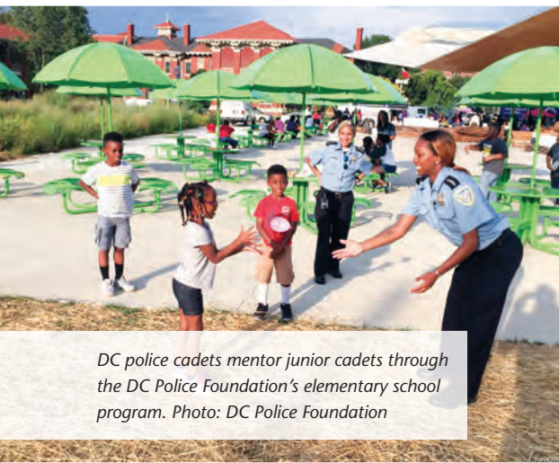
DC police cadets mentor junior cadets through the DC Police Foundation's elementary school program.