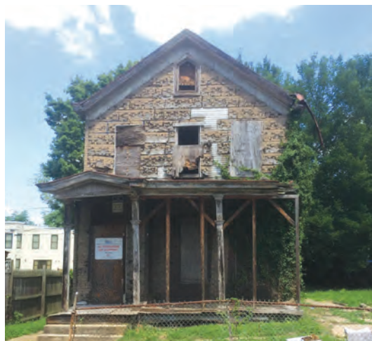
A broken down District house at 1326 Valley Place SE on the proposed legislation. Twyla Alston lives near this home.