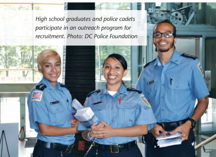
High school graduates and police cadets participate in an outreach program for recruitment.