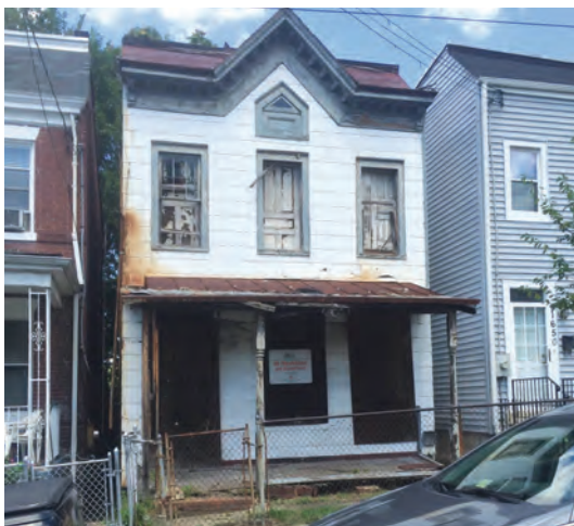
A rusted, stained District house at 1648 U St. SE on the proposed legislation to transfer to L’Enfant Trust.